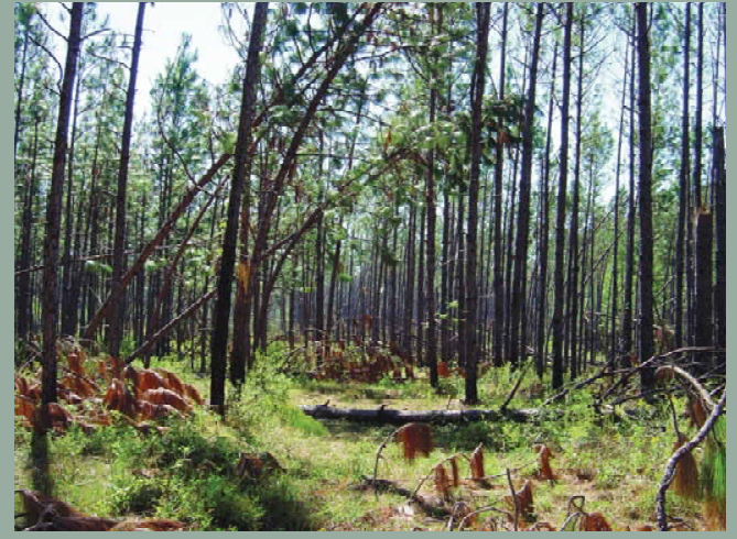
Damaged Slash Stand (left), Damaged Longleaf Stand (right).

Enough volume was retained in the longleaf areas to constitute a manageable stand. This is economically significant as there has already been 20 years invested in these stands. The storm