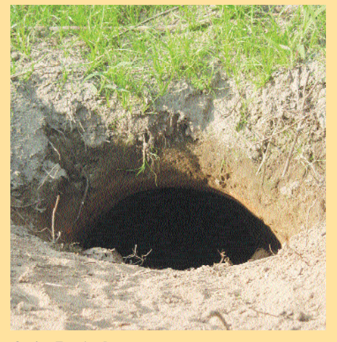
Gopher Tortoise Burrow

Pituophis melanoleucus lodingi Black pine snakes are generally dark brown to black. They have stout bodies and grow up to 6.5 feet in length. This subspecies of pine snakes range from Southwestern Alabama to Southeastern Louisiana and typically inhabit well-drained longleaf pine uplands. In Mississippi, the black pine snake has been recorded in nine Southeastern Counties. They are: Forrest, Perry, Greene, Pearl River, Stone, George, Hancock, Harrison and Jackson Counties.