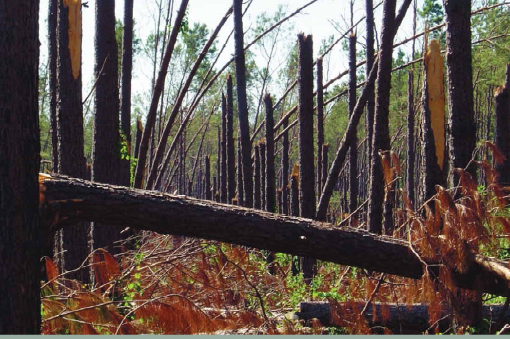
Damaged Loblolly Stand

consisting of snapped trees, there was a significant loss in value. Leaning and blown over trees accounted for 9.5 percent of the total damage.