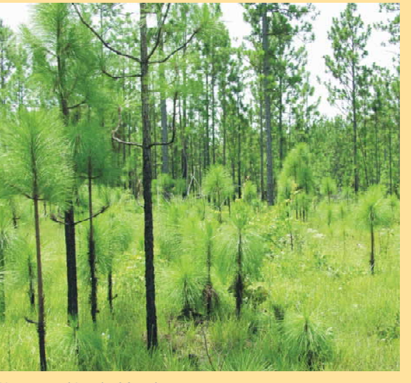
Uneven-aged Longleaf Stand

A stand with three or more distinct age (or diameter) classes is said to be uneven-aged. Maintaining a healthy forest in an uneven-aged condition requires different techniques than even-aged management systems. Uneven-aged management systems, as with other management systems, have inherent advantages and disadvantages (see Table 2).