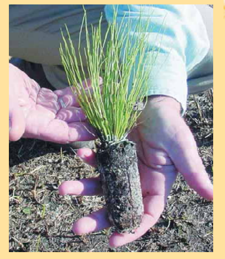
A Containerized Seedling

Care should be taken when handling longleaf seedlings. Seedlings