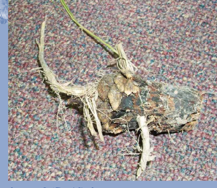
Congongrass Root Through Pine Cone

Infestations from this alien plant can have serious implications for resource management. Dense stands of this grass can cause significant stress on forested stands by competing for available moisture and nutrients and by literally growing through the roots of native trees. Cogongrass is also allelopathic, meaning it produces its own chemical enzymes that prohibit the growth of other vegetation. Dense stands also create physical barriers that keep native plant seeds from reaching mineral soil. Cogongrass also burns at extremely high temperatures (842'F) and dense stands can cause significant loss of forest products from either prescribed burns or from wild fires.