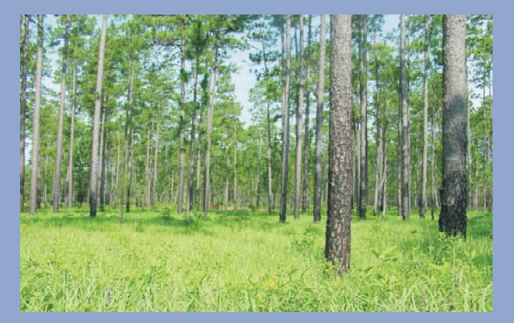
Congongrass Under Pines

Although cogongrass has a relatively high rate of natural spread, mechanical spread is accelerating the problem. Landowners and contractors spread cogongrass across the landscape by moving contaminated soil and equipment while conducting normal management practices such as timber harvest and the construction and maintenance of food plots, roads and fire lanes.