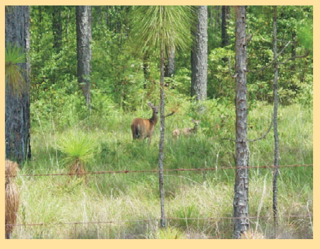
White-tailed Deer

White-tailed deer are plentiful and are considered the most popular big game species in the United States. However, white-tailed deer have not always been abundant. During the early 1900s, deer populations were limited in many of the Southeastern states because