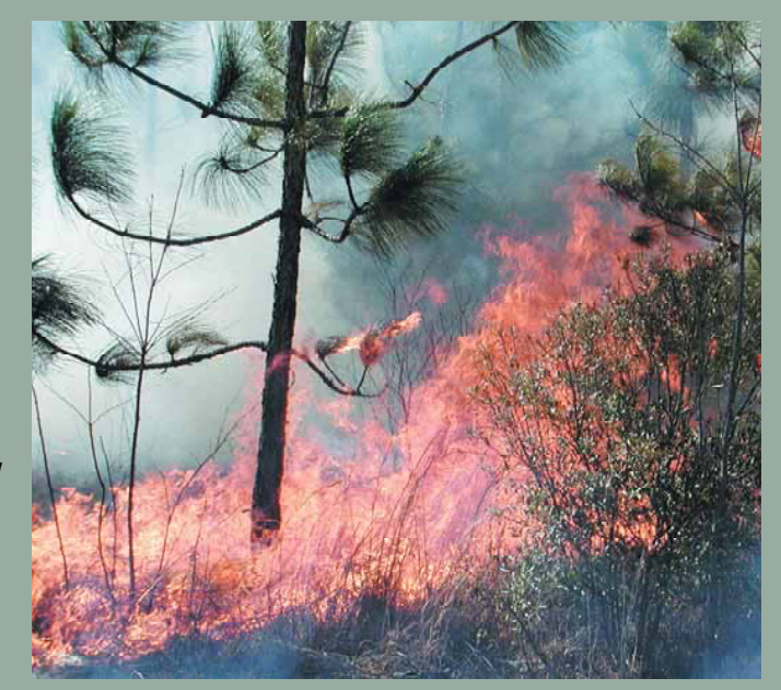
Prescribed Burning

The level and intensity of longleaf pine management conducted on a property will depend upon site quality, topography, location, ability to use fire and overall objectives of the landowner. Objectives should be prioritized to best meet the landowner's needs. Is the primary objective forest products, wildlife management or recreation? Landowners interested only in forest products will probably establish and maintain stands at higher densities than those interested primarily in wildlife. Conversely, those interested in wildlife and recreation may wish to maintain their stands at lower