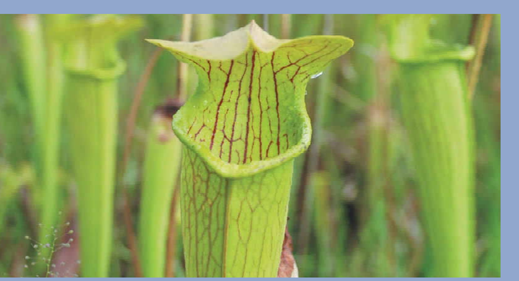
Yellow Pitcher Plant

Savannas, because of a high water table, are typically the wettest of the longleaf communities. Savannas are open with little overstory. Understory plant communities are very diverse and may contain wiregrass, sedges, orchids, American chaffseed and rough-leaved loosestrife. Insectivorous plants that may be found include pitcher plants, bladderworts, venus flytrap and sundews. Rare, threatened or endangered birds that may occur in these areas include Henslow's sparrow, Bachman's sparrow, red-cockaded woodpecker and Mississippi sandhill crane.