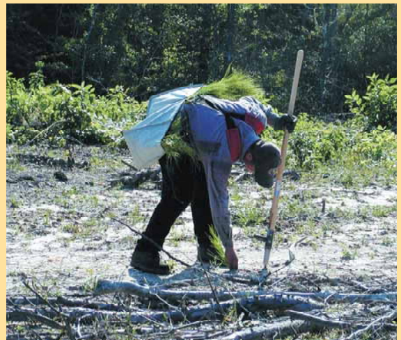
Planting Seedlings

Spacing and planting densities vary with the goals of the landowner. Seedling densities can range from 400 to 700 seedlings per acre. If low survival is anticipated, as during years of severe drought, more seedlings may be planted to offset mortality. Lower densities may be desirable where a more open condition is wanted. This might be desirable