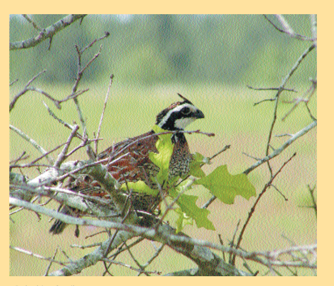
Bobwhite Quail

Bobwhite quail populations have been on an overall decline for several decades. The decline has been attributed to the loss of quality habitat and an overall degradation of the remaining habitat. For instance, quail are weak scratchers and are inhibited by dense stands of