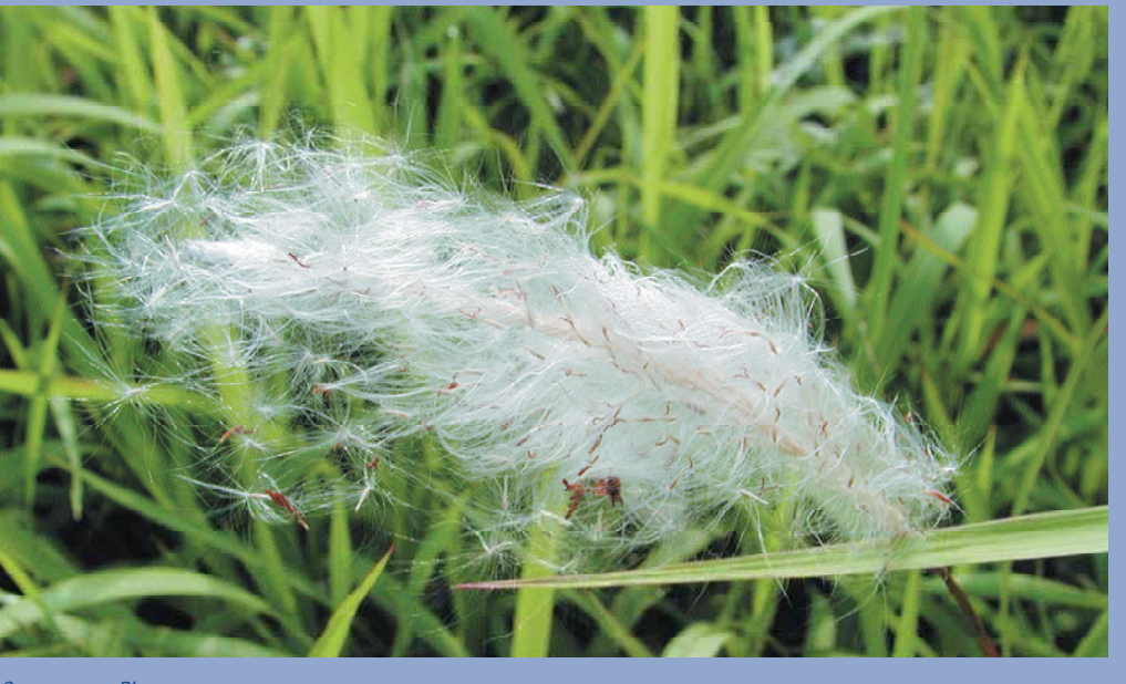
Congongrass Bloom

Cogongrass is an invasive, perennial grass that produces dense stands reaching heights of 4 feet. Identifying characteristics include an off-set midrib on the leaves and dense. distinctive flower heads in early spring. Cogongrass has numerous attributes that contribute to its extremely invasive characteristics. Each plant can produce up to 3,000 seeds. Seeds are very light and can be dispersed by the wind for a distance of 15 miles or more.