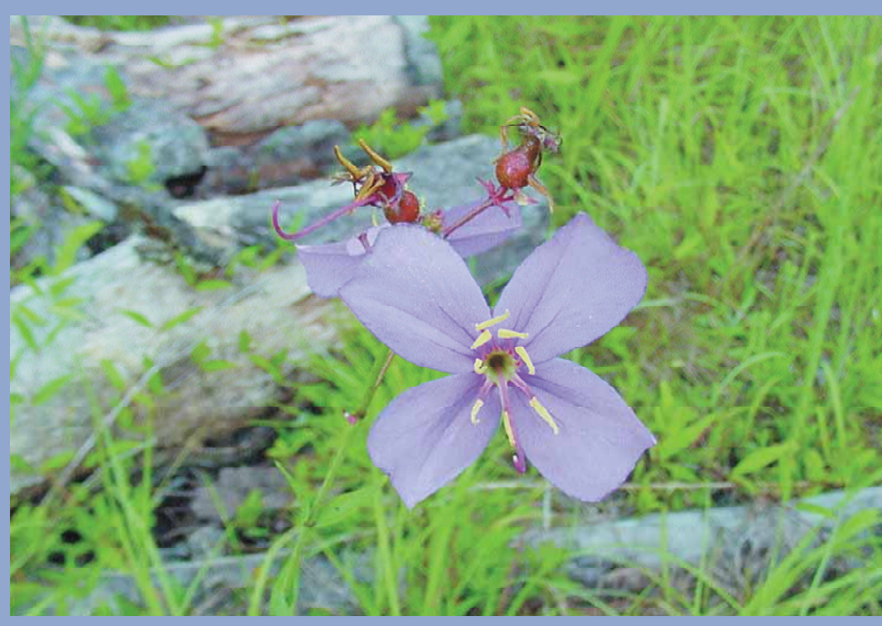
Meadow Beauty

Rolling mesic hills are among the most productive longleaf sites. Often with a sandy surface, they have fine textured soils with higher clay contents and are very diverse. Loblolly and shortleaf pine along with numerous species of hardwoods occur in association with this community. Species of hardwoods include gallberry, yaupon, wax myrtle, blueberry, huckleberry, sweetgum, blackgum, Southern red oak, post oak, live oak, white oak, chinkapin, dogwood, black cherry and hickories. Understory vegetation includes Indian grasses, three-awn grasses, bluestem grasses, meadow beauties and dropseeds. Wildlife that may be found in rolling mesic hills include white-tailed deer, black bear, wild turkey, bobwhite quail, fox squirrel, cottontail rabbits, gopher tortoise, Eastern diamondback rattlesnake, Louisiana and black pine snakes, redcockaded woodpecker, Bachman's sparrow, great crested fly catcher, indigo bunting and summer tanager.