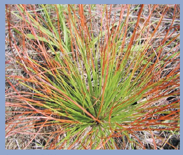
Brown-spot Needle Blight

Pathogens that affect all Southern pines include annosus root rot, fusiform rust and pitch canker. Although longleaf can be infected with these pathogens, they are less susceptible to these diseases than loblolly or slash. However, brown-spot needle blight is a serious disease of longleaf and can suppress growth and eventually kill grass-stage seedlings. Brown-spot is a fungal infestation that causes needle loss in grassstage seedlings, but is not a significant