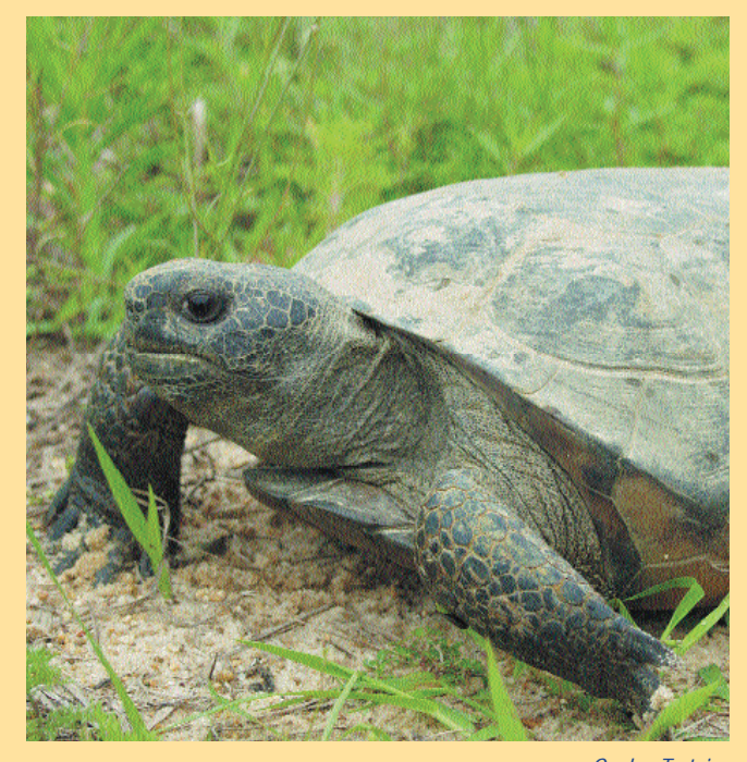
Gopher Tortoise

Populations of gopher tortoise are scattered throughout the Gulf Coastal Plain with most being found in North-central Florida and Southern Georgia. Limited numbers of tortoises are found in Southeastern Louisiana, the southern third of Mississippi and Alabama.