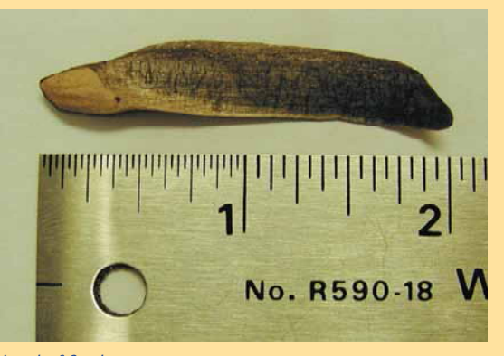
Longleaf Seed

Shelterwood, or modified shelterwood systems, are effective ways to regenerate existing evenaged stands of longleaf. Instead of clearcutting and replanting, a fairly dense overstory of seed trees are retained until adequate regeneration is established. Spacing between trees is not particularly important in early thinnings of an even-aged stand. Rather, attention should be given to removing diseased, improperly formed or